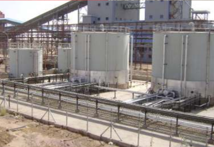
Piping System and Storage Tank