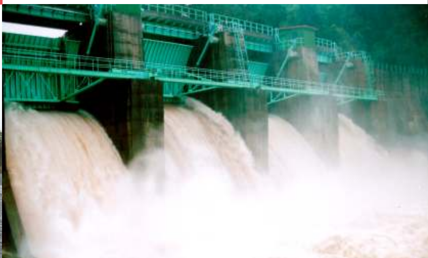
Gates and Accessories