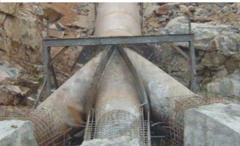
Penstock and Steel Liners