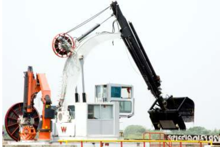
Trash Rack Cleaning Machine